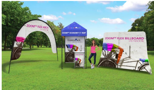
New outdoor displays released in 2019 include popup tents, billboards, signs and accents.