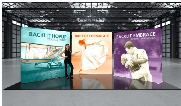
Enhancements were made to the Hopup™ Backlit and Embrace™ Backlit systems along with new Formulate® Master illuminated backwalls and towers.