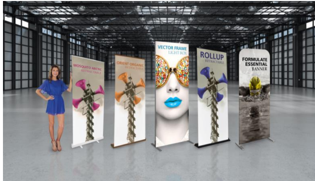
Orbus released new retractable banners and expanded its current Formulate® Essential Banner line, adding three new sizes.